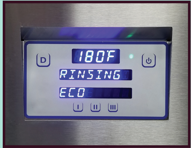
Digital LED Display

Ease of serviceability is important to Jackson, and with that in mind, the DynaStar VER was designed to utilize common Jackson parts, as well as making service access easy. All service parts can be accessed while the unit is in place - no need to pull it from the wall or disconnect tables.